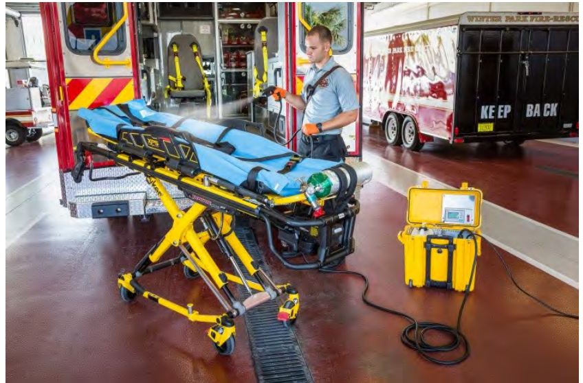
FIGURE 2 USING RDS 3110 FOR AMBULANCE DECON

In 2012 we were asked to field trial AeroClave’s new portable unit, the RDS 3110. This 45 pound unit is about the size of a carry-on suitcase and because of its dual application capabilities (hand spray and fogging), we were now able to start treating the fire station as well as the rescues and engines (Figure 2). Studies have shown (and we can all attest to the fact) that fire stations can be dirty places with multiple individuals sharing common spaces, a recipe for contagious disease outbreaks. The RDS 3110 allowed us to treat the dayroom, bunkrooms, kitchen, gym and other areas of the station at least weekly but also on an as-needed basis (figure 3). For example, if a firefighter developed a cold, flu or other potentially contagious disease, his bunkroom and gear could immediately be treated using the AeroClave system.