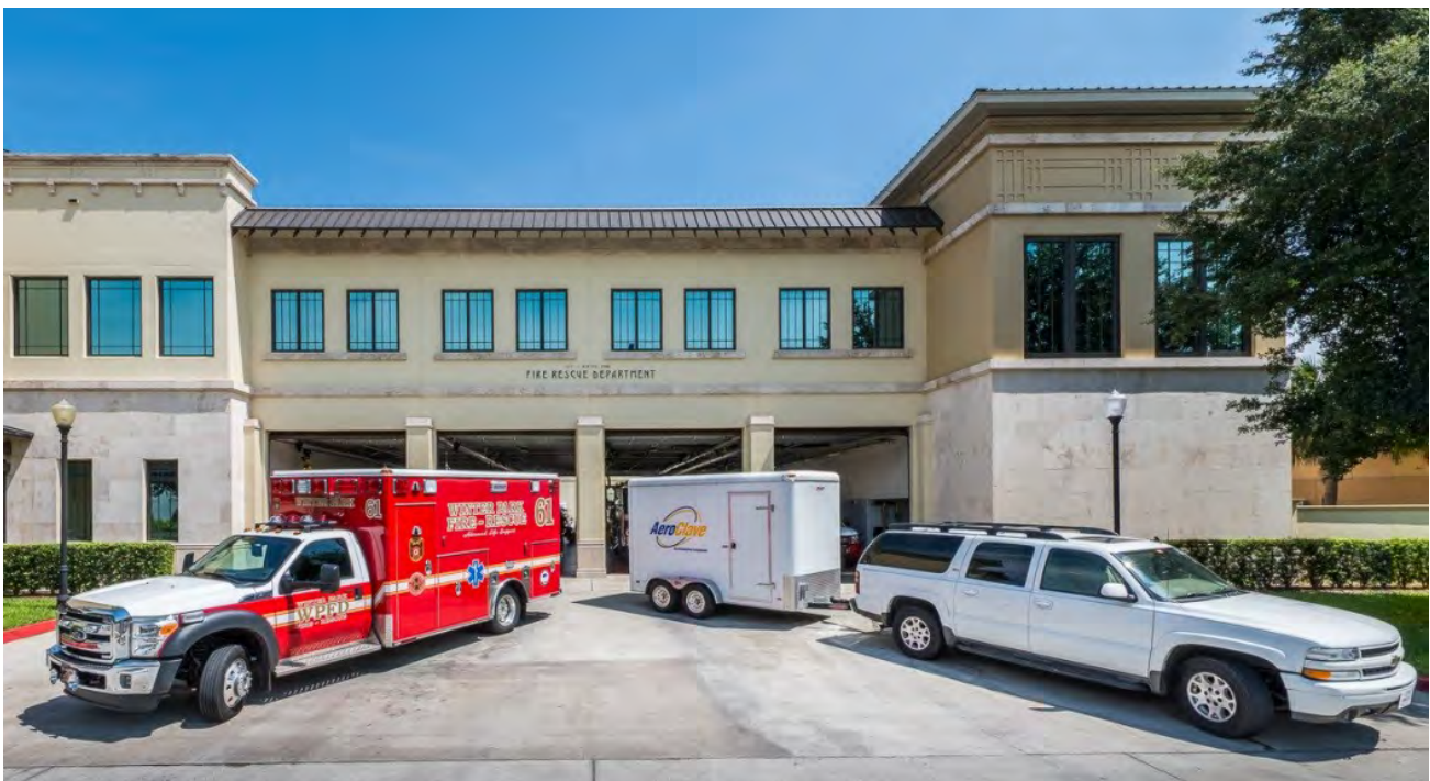
WORKING TOGETHER FOR A SAFER TOMORROW