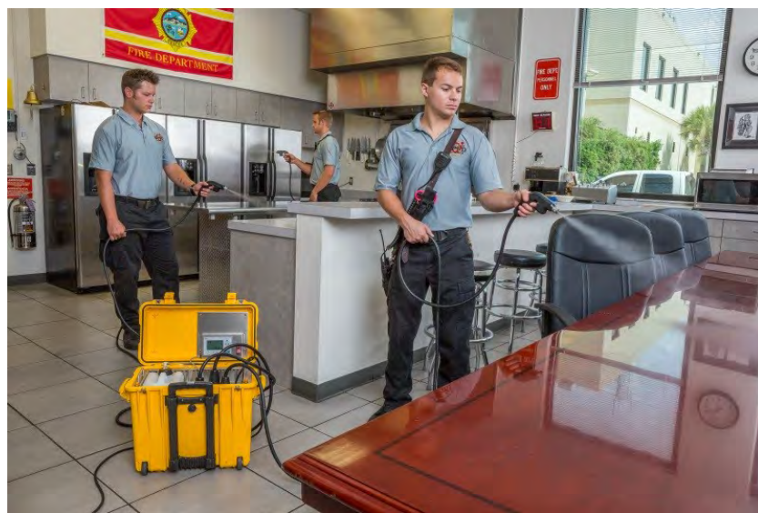
FIGURE 3 USING RDS 3110 FOR STATION INTERIOR DECON

Although we initially designated individuals as “keepers” of the unit, its ease of use made it possible for all personnel to quickly be trained in the proper and effective use of the equipment. It soon became a regular part of the daily cleaning routine. Because we had three stations and only one RDS 3110, the unit was kept in the Battalion Chief’s vehicle and transported to wherever it was needed.