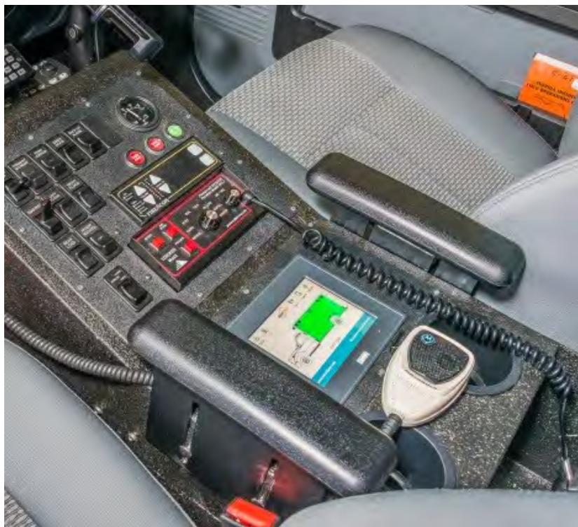
FIGURE 4 TOUCH SCREEN CONTROLLER FOR ADS UNIT

screen computer located in the front console (Figure 4). It was installed during the construction of our new rescues by a local ambulance manufacturer. It is a highly sophisticated yet compact device that performs the same high level decontamination, and enables the AeroClave process to occur wherever or whenever desired. For example, our crews regularly initiate the decontamination process after unloading the patient at the Emergency Department. Because the process only takes about 20-25 minutes, the cycle is usually complete by the time they are ready to go back into service. Our crews take great comfort in the fact that they are doing everything possible to break the chain of disease transmission between patients and perhaps even between different crew members. Recently, there was great concern about possible exposure to Ebola to the multiple patients and personnel from different shifts that occupied the Dallas rescue for several days after the initial Ebola patient was transported. We believe that by using the AeroClave process after each patient (or at least after any suspected high-risk patient) might prevent future concerns to patients, crews and their families. Our current policy requires the units be “AeroClaved” at least once daily at morning truck check, however, we encourage the crews to initiate the process whenever they deem it necessary.