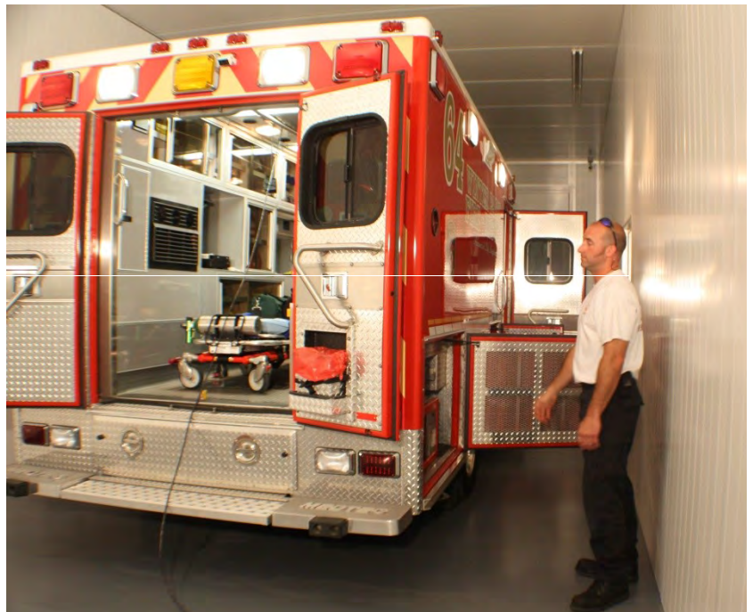
FIGURE 1 RESCUE INSIDE AEROCLAVE TREATMENT CHAMBER

Initially, the AeroClave unit consisted of a drive-in vehicle decontamination chamber located at their facility, which is in close proximity to our stations. We brought our ALS rescues, engines and battalion vehicles to the chamber for treatment on about a once-a-month basis. The vehicles were placed in the treatment chamber and all the interior and exterior doors and compartments were opened (Figure 1). Jump bags, monitors and other equipment were placed on ventilated shelves located within the chamber. Because this is a surface decontamination process only, we did not have to remove any packaged medications or other prepackaged items. Radios and computers were left in the vehicles though powered down. The effectiveness of the process was validated using industry standard biologic indicators placed throughout the vehicles and harvested after the completion of the treatment cycle. After some initial fine-tuning of the process, we were able to show a consistent and high level disinfection of all the interior and exterior surfaces of the vehicles. Repeated inspections over a several year trial basis failed to reveal any damage to vehicle finishes, electronic equipment or other equipment.